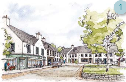
Hume Square (Start/Finish)